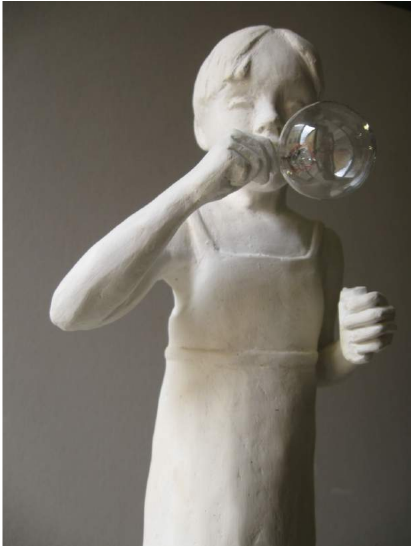
RICORDI AL VENTO