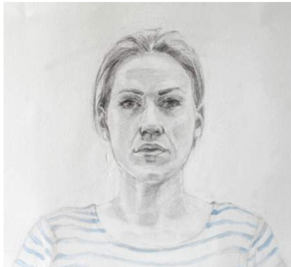
BLEU / INFINITO 2

What is revealed by the unmasked circus?